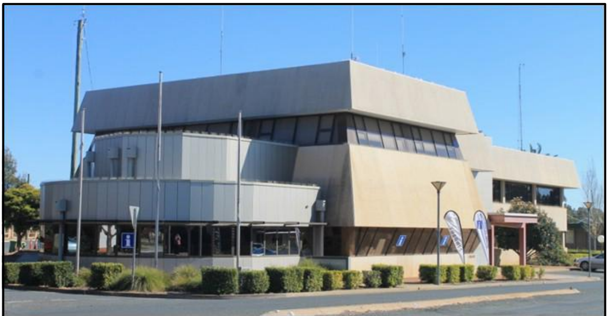
Bland Shire Council Administration Building 6 Shire Street West Wyalong NSW 2671