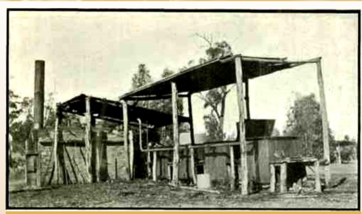
Four-tank Eucalyptus Oil Still, Steam from Boiler. Wyalong, N.S.W. (Wattle Brand Eucalyptus Oil Co.)