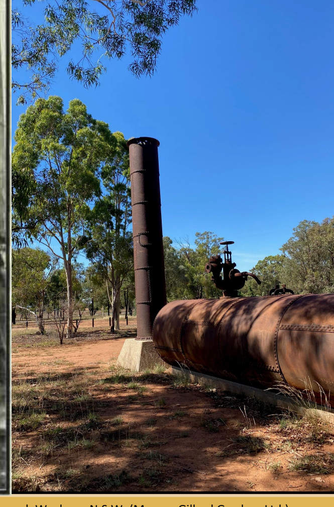
Eucalyptus Oil Still, with Two Iron Digesters Sunk in the Ground. Wyalong, N.S.W. (Messrs. Gillard Gordon, Ltd.)