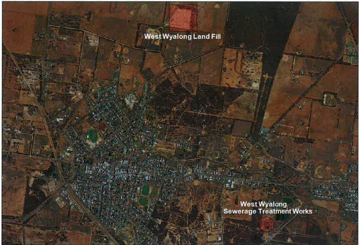
Map of West Wyalong NSW.